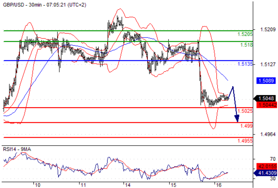
GBP/USD - 30min - 07:05:21 (UTC+2)